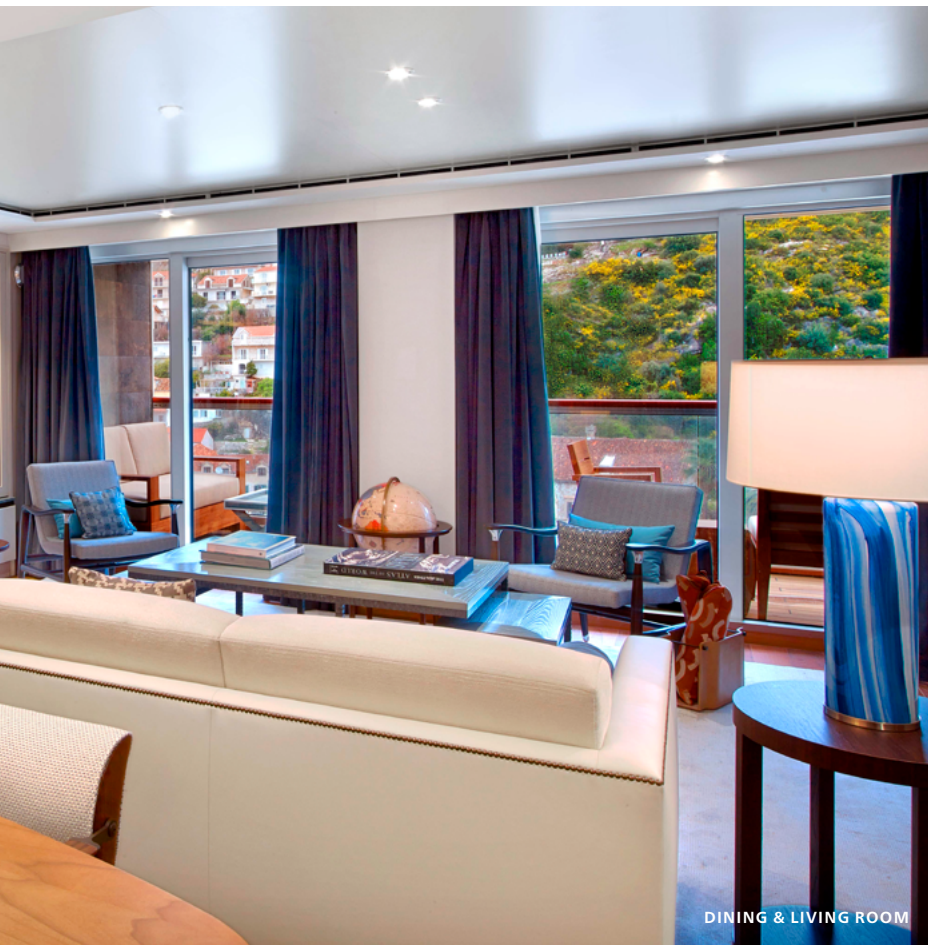
DINING & LIVING ROOM