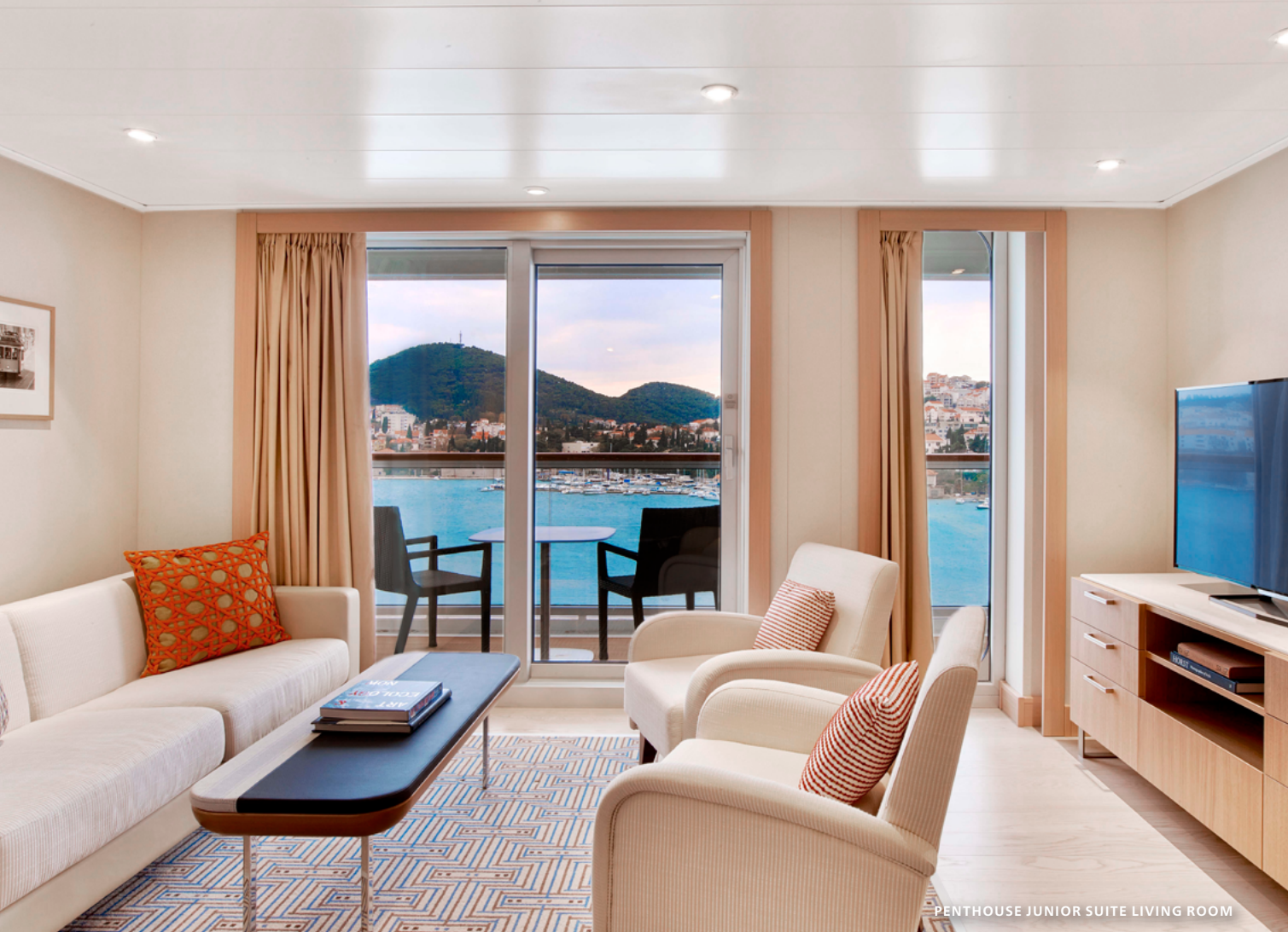
PENTHOUSE JUNIOR SUITE LIVING ROOM