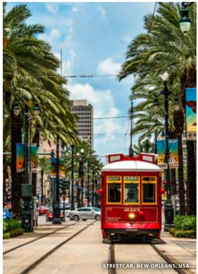
STREETCAR, NEW ORLEANS, USA