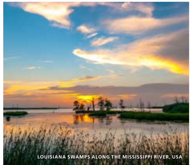
LOUISIANA SWAMPS ALONG THE MISSISSIPPI RIVER, USA