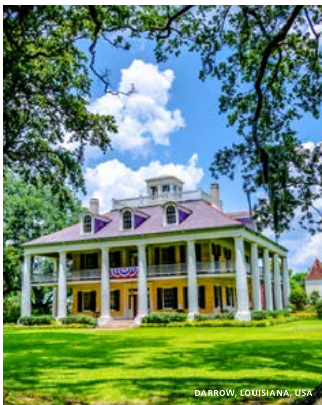
DARROW, LOUISIANA, USA