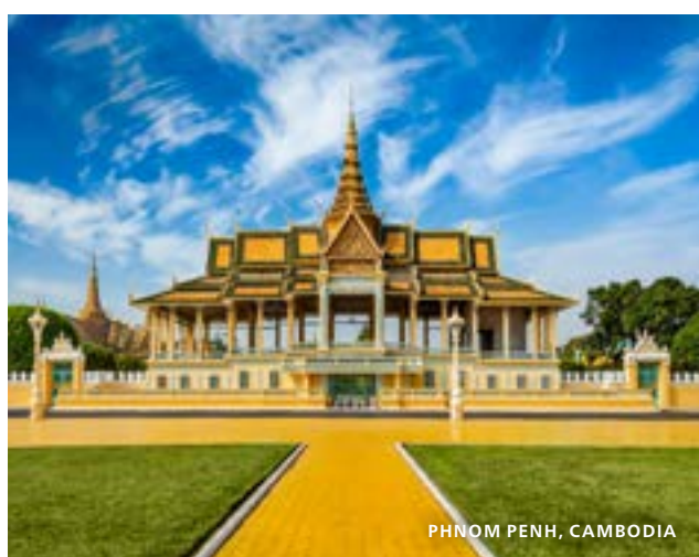
PHNOM PENH, CAMBODIA

Shop Old Hanoi's markets. See the Khmer temple complex of Angkor Wat. Behold the haunting beauty of Ta Prohm Temple, where jungle vines embrace ancient ruins. Discover silk towns, fishing villages, monasteries and local river life. With hotel stays in Hanoi, Siem Reap and Ho Chi Minh City (Saigon) bracketing your eight-day Mekong voyage, this cruisetour reveals the beauty and grace of a land we have only begun to know.