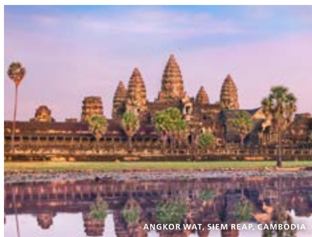
ANGKOR WAT, SIEM REAP, CAMBODIA