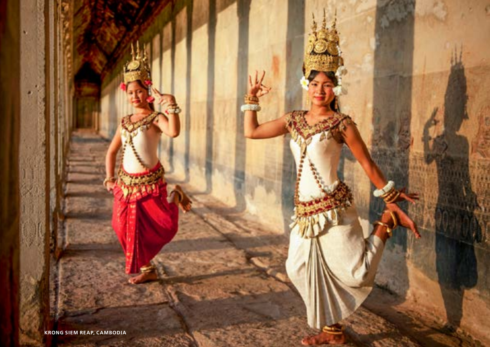
KRONG SIEM REAP, CAMBODIA