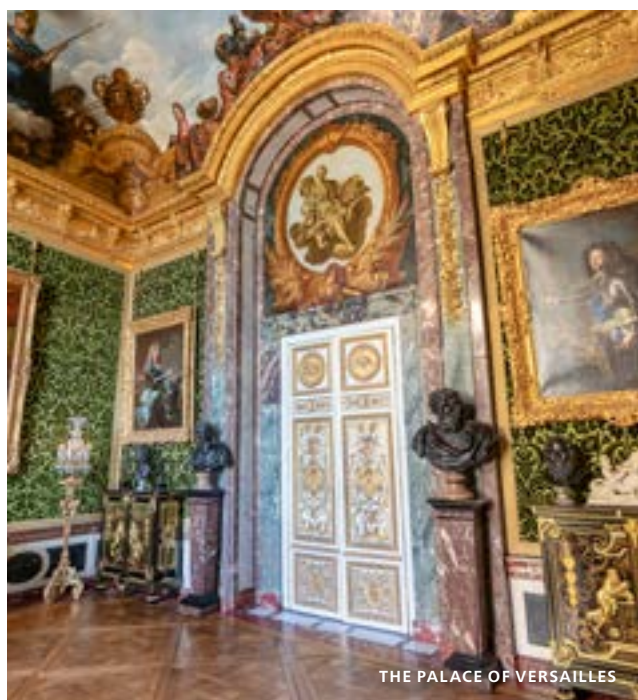
THE PALACE OF VERSAILLES

Witness memorials to a World War II invasion that had far-reaching consequences for the British Commonwealth. Drive to the town of Bayeux to visit the Memorial Museum of the Battle of Normandy. Visit the beaches of Normandy. See Gold Beach and the seaside village of Arromanches. INCLUDED