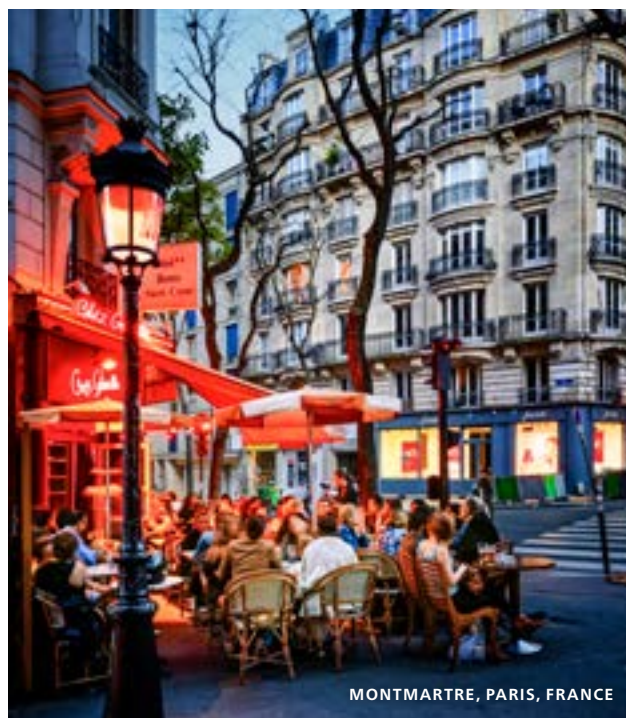
MONTMARTRE, PARIS, FRANCE