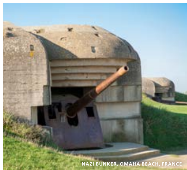
NAZI BUNKER, OMAHA BEACH, FRANCE