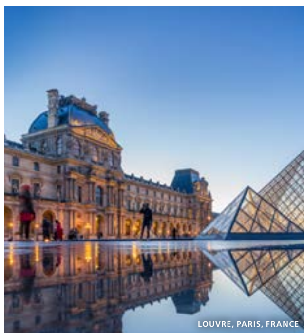
LOUVRE, PARIS, FRANCE