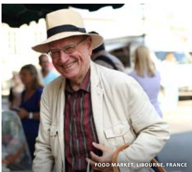
FOOD MARKET, LIBOURNE, FRANCE

Discover the ports, vineyards, farms and forests of Aquitaine, once Europe's richest kingdom. See Bordeaux's fountains and cellars. Hunt for truffles in Périgord, and create your own personal blend of Cognac at the Camus distillery. Savour France's finest oysters fresh from the bay at Arcachon. Sip Saint-Émilion, Médoc and Sauternes in their own terroir on an eight-day voyage through Bordeaux—a region synonymous with fine wine and finer living.