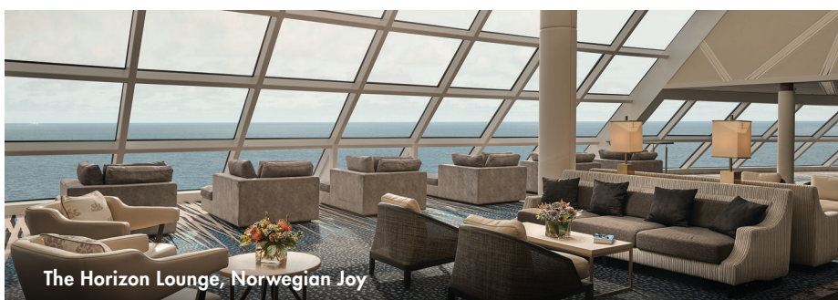
The Horizon Lounge, Norwegian Joy