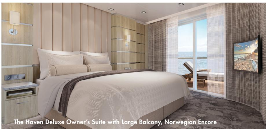
The Haven Deluxe Owner's Suite with Large Balcony, Norwegian Encore