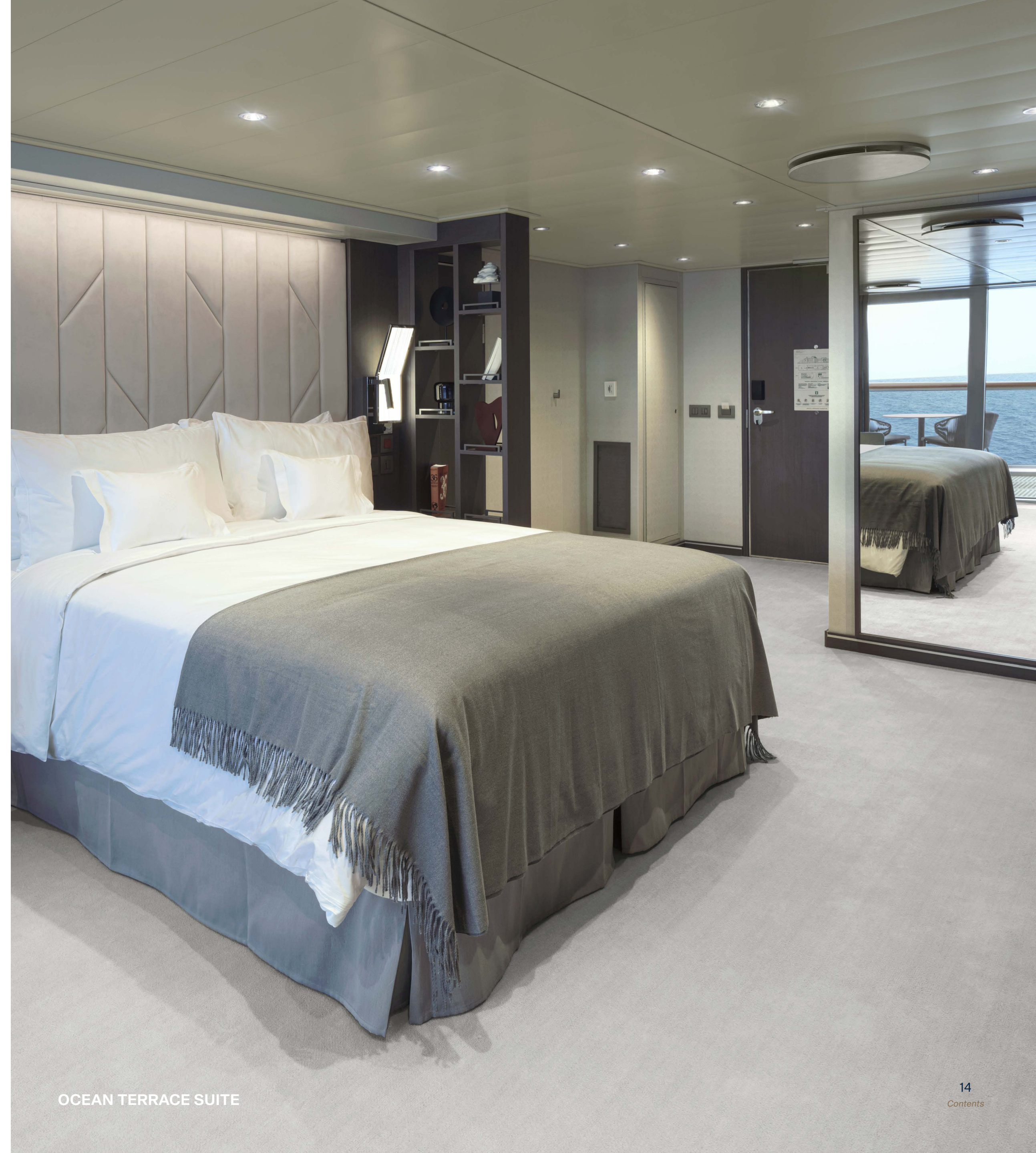
OCEAN TERRACE SUITE