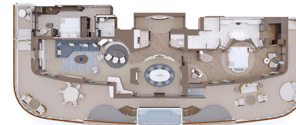
OR + OT2

This layout corresponds to the Owner's Residence