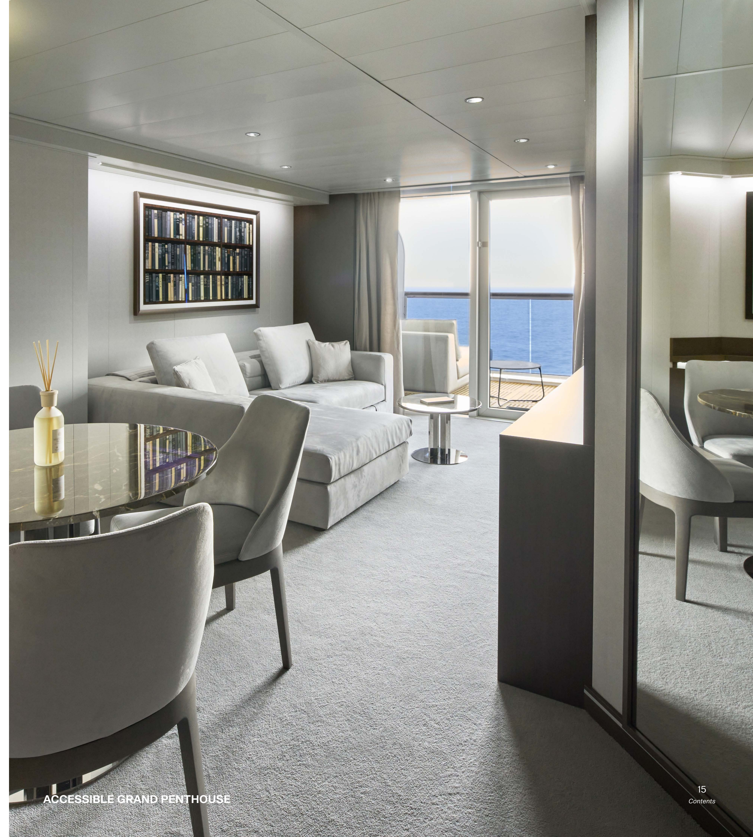
ACCESSIBLE GRAND PENTHOUSE

Features may vary by suite. Please inform your Travel Advisor or the Explora Experience Ambassador of your preferences and requirements when booking.