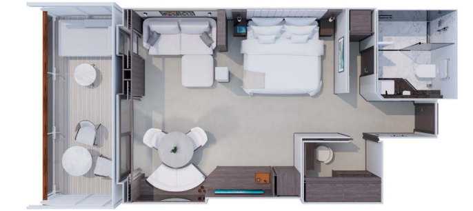
This layout corresponds to Penthouses on decks 7, 8, 9