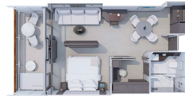
This layout corresponds to Deluxe Penthouses on decks 9 and 10