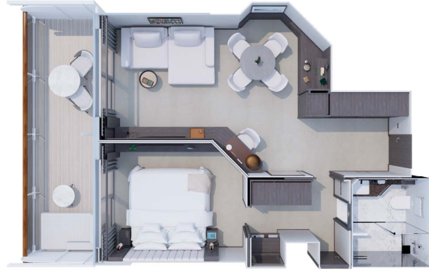
This layout corresponds to Grand Penthouses on decks 7, 8, 9, 10