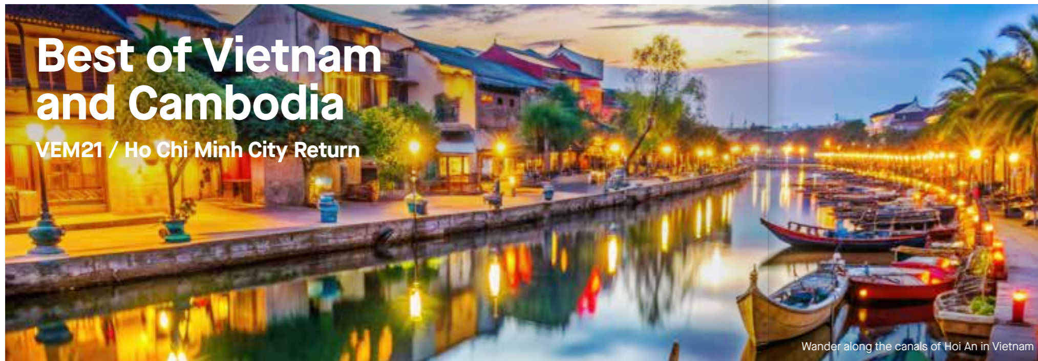
Wander along the canals of Hoi An in Vietnam