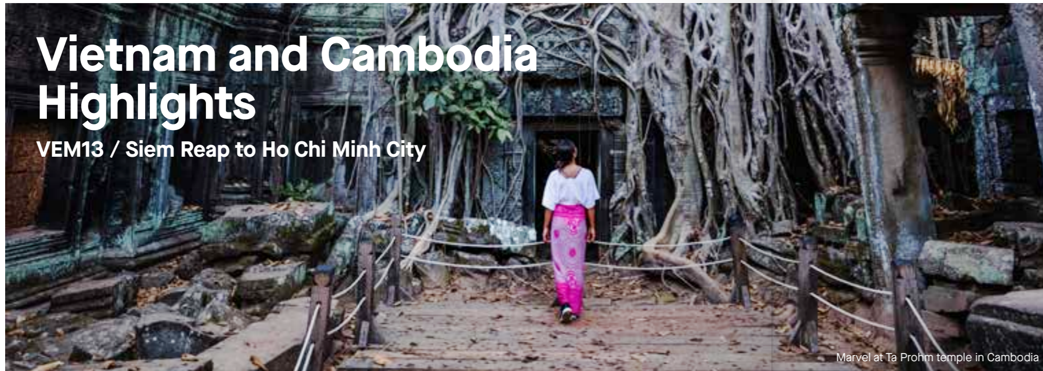
Marvel at Ta Prohm temple in Cambodia

Discover wonders on land and cruise along the enchanting Mekong River