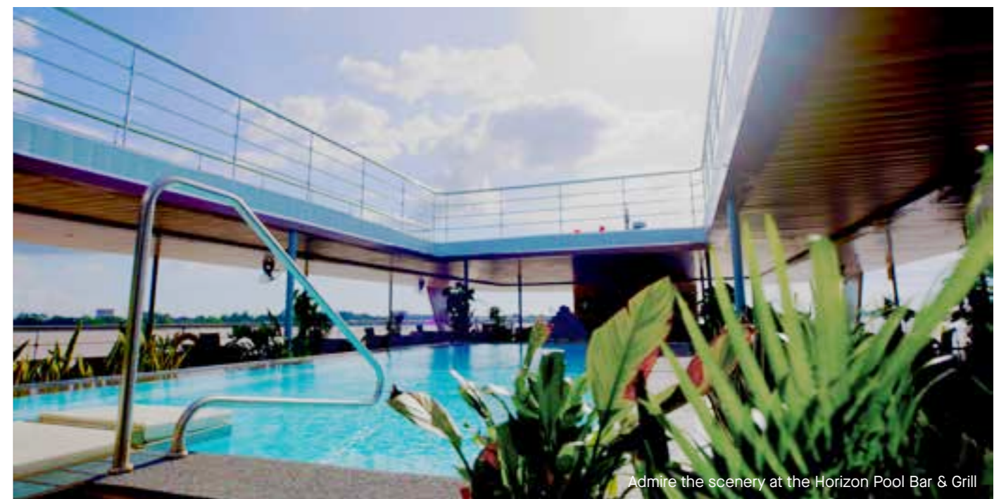
Admire the scenery at the Horizon Pool Bar & Grill

Unwind at the onboard spa after a day of exploring. Rejuvenate with a massage, visit the onboard hairdresser, or indulge in a facial, manicure or pedicure. Feeling relaxed and pampered is all part of the Mekong Serenity experience.