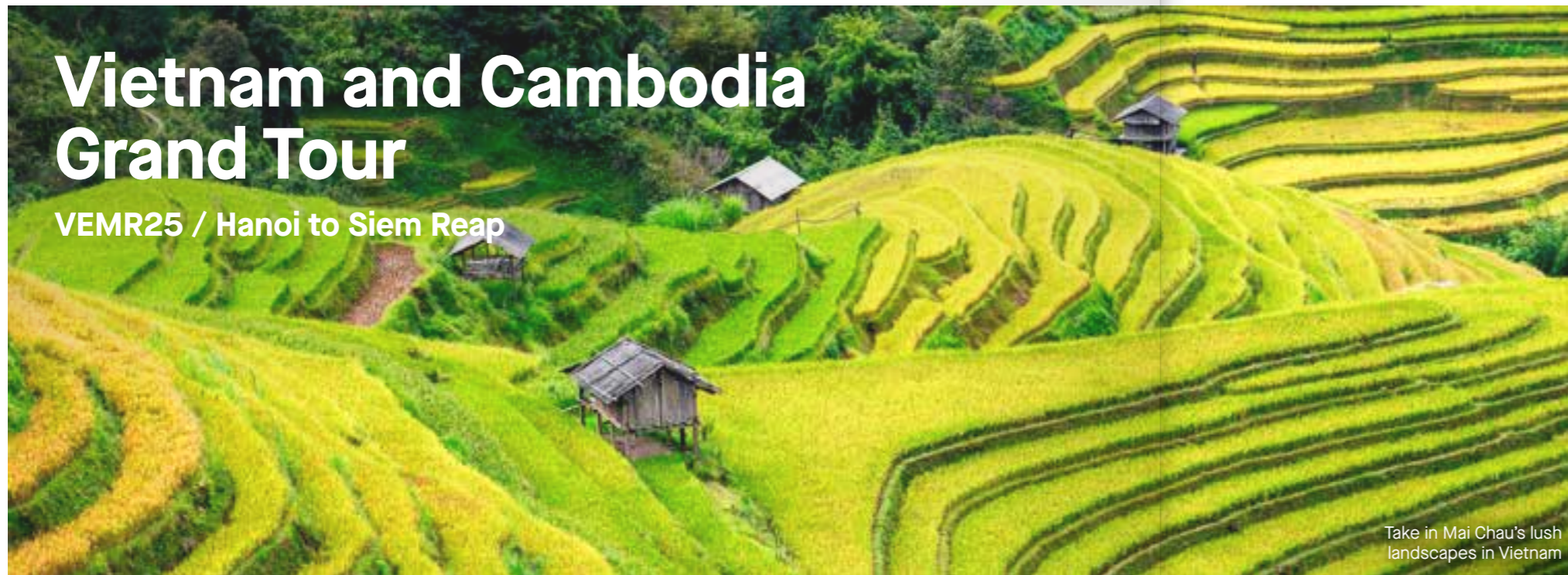
Take in Mai Chau's lush landscapes in Vietnam

25 Days / 15-Night Land Tour + Seven-Night River Cruise + Two-Night Small Ship Cruise