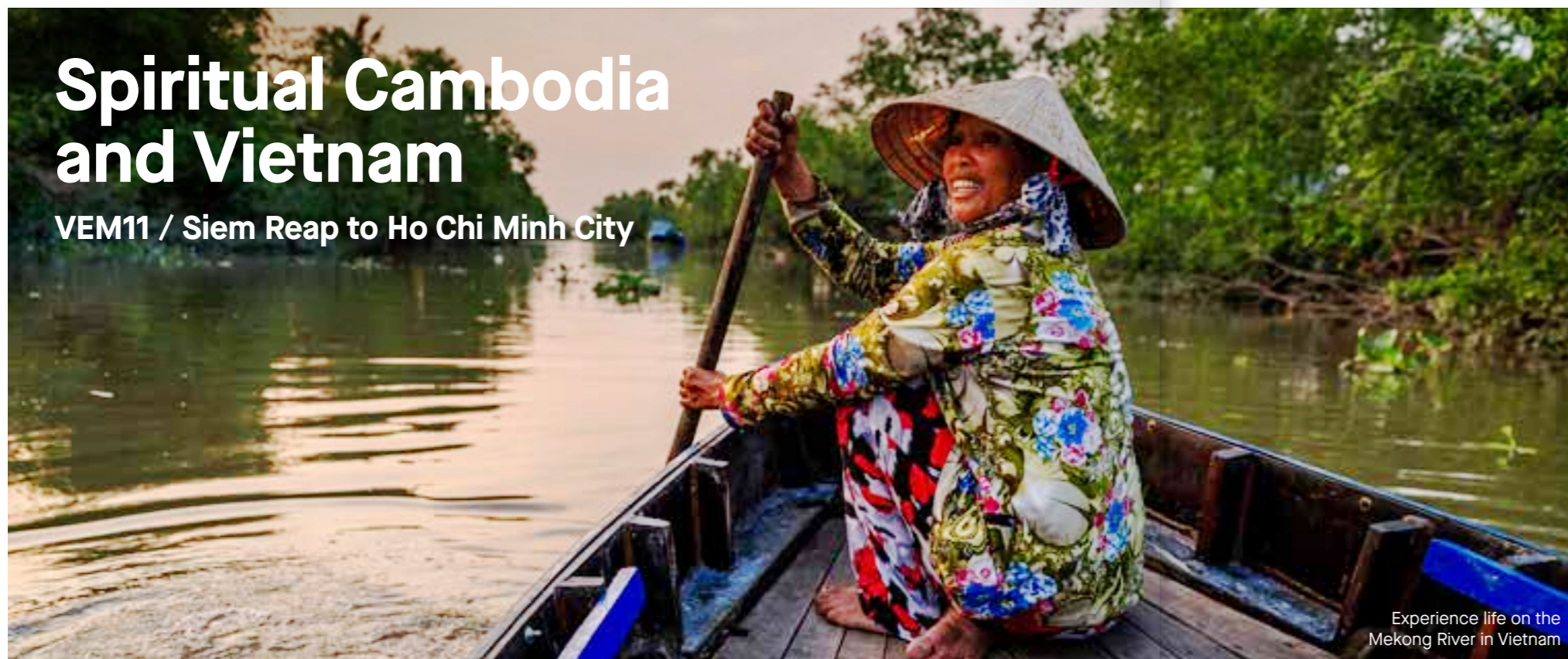
Experience life on the Mekong River in Vietnam