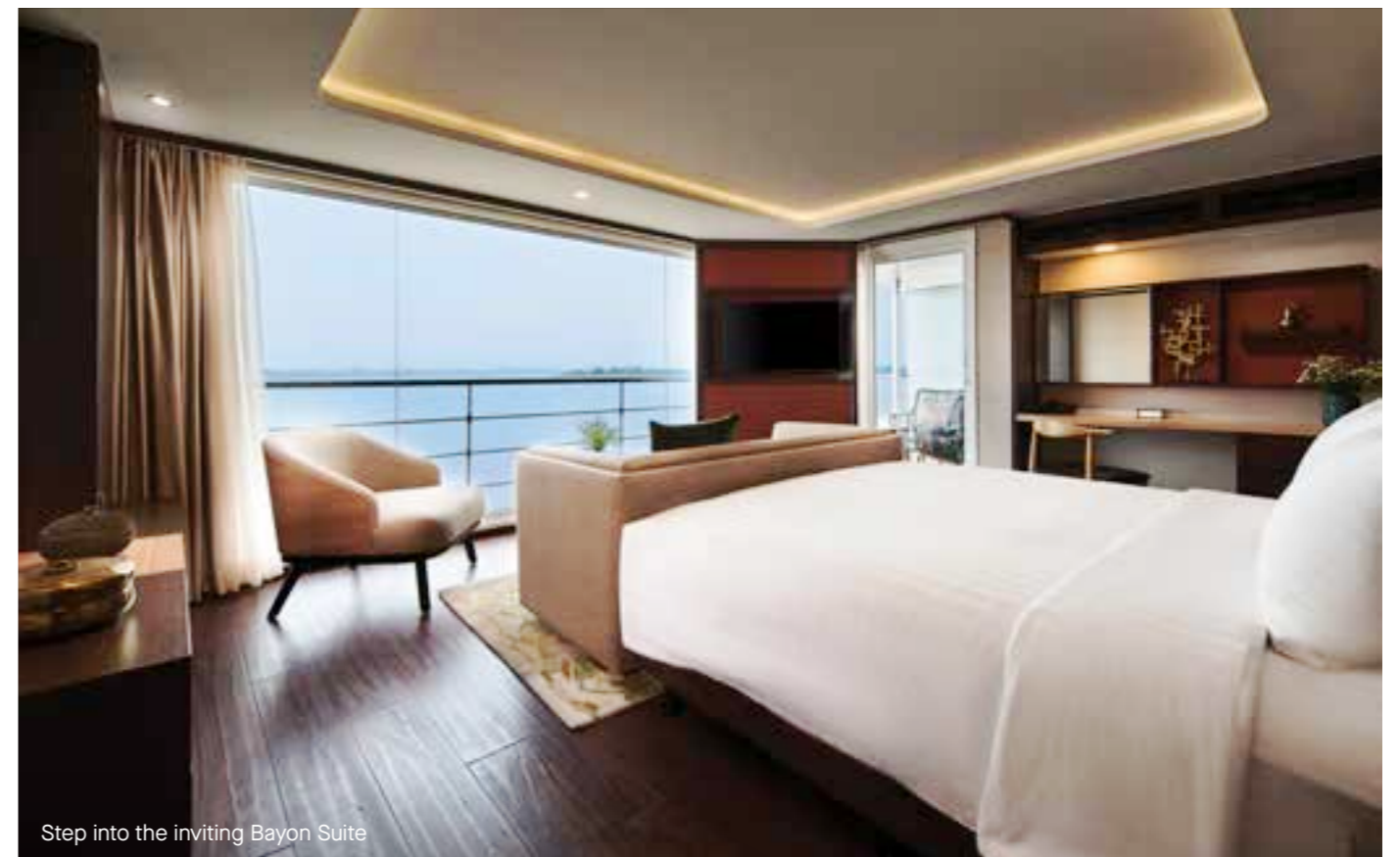
Step into the inviting Bayon Suite

Angkor Suites feature a deluxe bedroom with a king-size bed and lounge area, a separate en suite with a spa bath, a spacious living room with floor-to-ceiling windows, and an expansive balcony terrace. Indulge in Gold Butler Service, which includes a packing and unpacking service, a bottle of champagne on arrival, tea and coffee service, and pre-dinner canapés, along with all the amenities of Silver Butler Service.