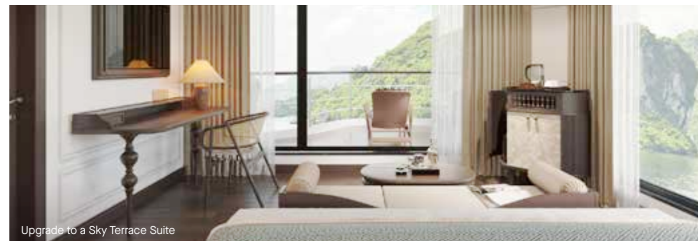
Upgrade to a Sky Terrace Suite