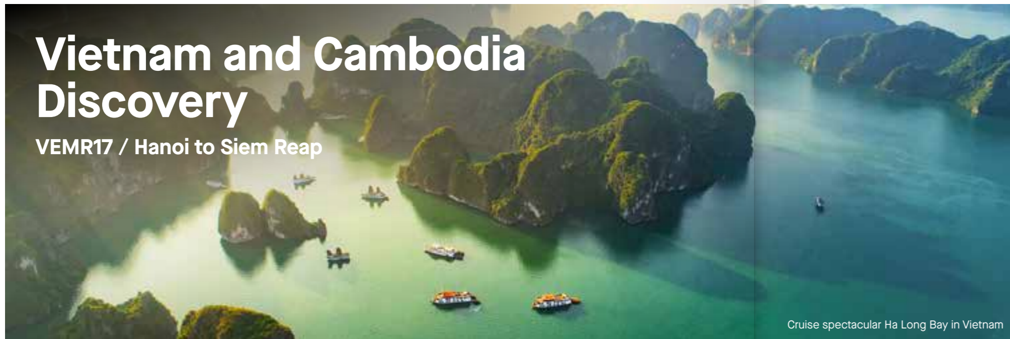
Cruise spectacular Ha Long Bay in Vietnam