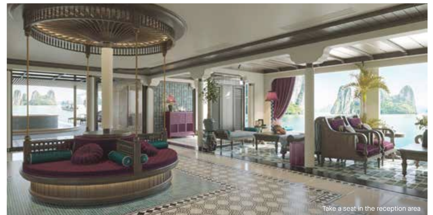
Take a seat in the reception area