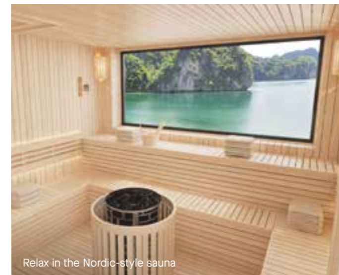
Relax in the Nordic-style sauna

Whether enjoying a quiet sunrise, a golden sunset, or stargazing, discover unrivalled views of Ha Long Bay and Lan Ha Bay from the Sun Deck and its 360° Observation Peak.